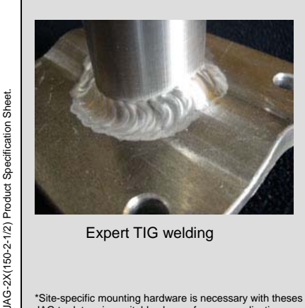
Expert TIG welding