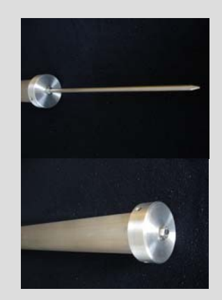
Optional lightning rod

*Site-specific mounting hardware is necessary with theses antennas. Please consult JAG to determine suitable clamps for your application