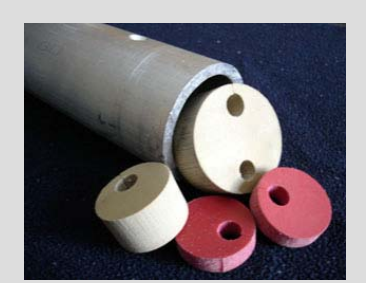
Natural rubber plugs