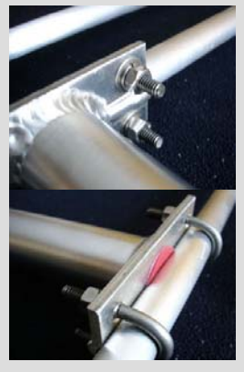
Heavy-duty dipole fixture